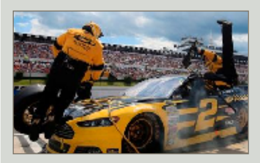
PIT STOPS CONTINUE EVERY WEDNESDAY PAGE 2