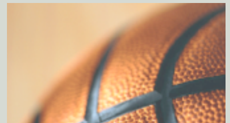
HOOPS4HIM FINISHES UP THE SEASON PAGE 4