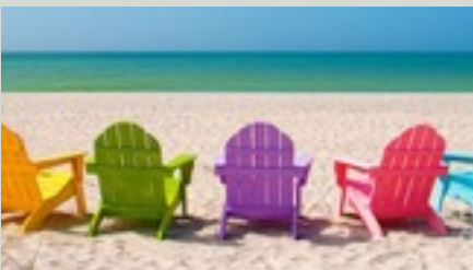
THE SNOW WILL MELT AND SUMMER IS COMING PAGE 2