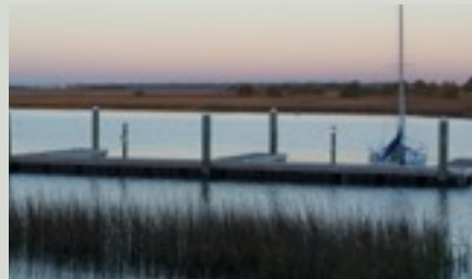
YOUTH SPRING BREAK RETREAT AT CASWELL PAGE 3