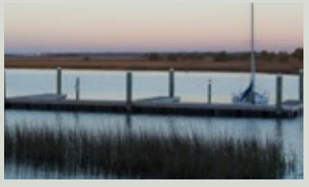
YOUTH SPRING BREAK RETREAT AT CASWELL PAGE 3