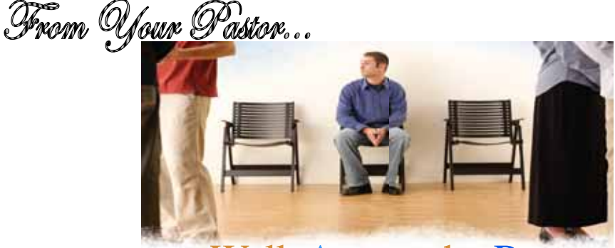
Just Walk Across the Room The Four-Week Church Campaign

"A people gathered in Christ; nurtured in His Spirit; and sent in His name."